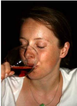
We all have an opinion on Barnsley's night life. But what do we want the town to offer us in the evening?

Everybody has a view about Barnsley at night. A great night out? Too many pubs? Not enough restaurants? No decent nightclubs?